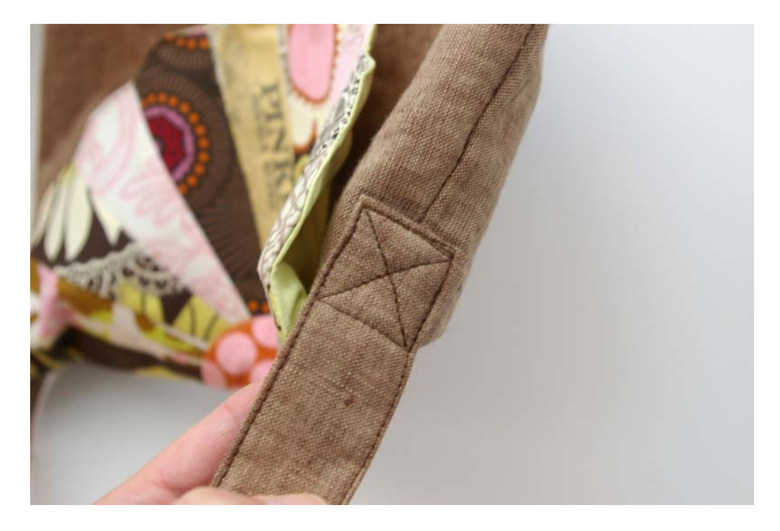
Fill it on up and enjoy! You have completed your Scalloped Dresden Bag. Carry it with pride!

15. Attach strap to bag, with one inch of overlap on the exterior.